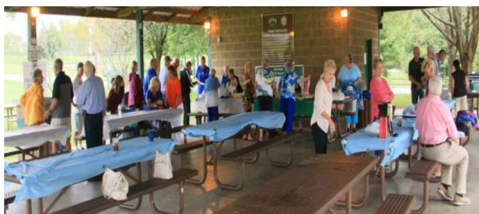
Bluegrass West Picnic

Bluegrass West's speaker cancelled in August, and the annual picnic was held in September at the Juniper Hills Park Pavilion. The picnic was well attended and was enjoyed by all.