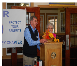
Nov. CV Meeting