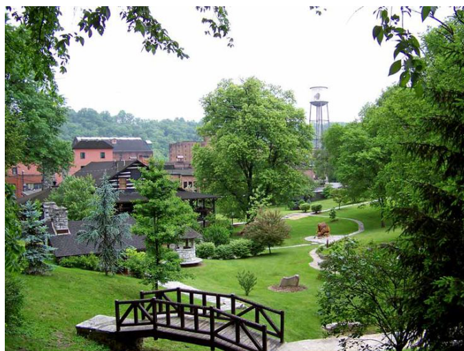
Buffalo Trace Distillery

My own relationship with KPR goes back but a few years – I retired in 2010. At first I thought we were just a nice social organization, meeting monthly, having programs, then going our separate ways. It was at these meetings that I began to hear about the problems with the pension systems. When I learned that KRS meetings were open to the public, I started to attend and that is where the magnitude of the issues hit me square in the face.