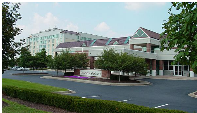
Sloan Convention Center