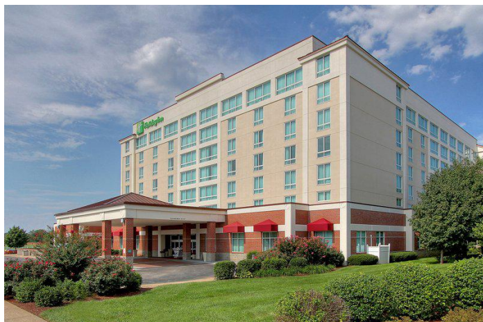
Holiday Inn, University Plaza