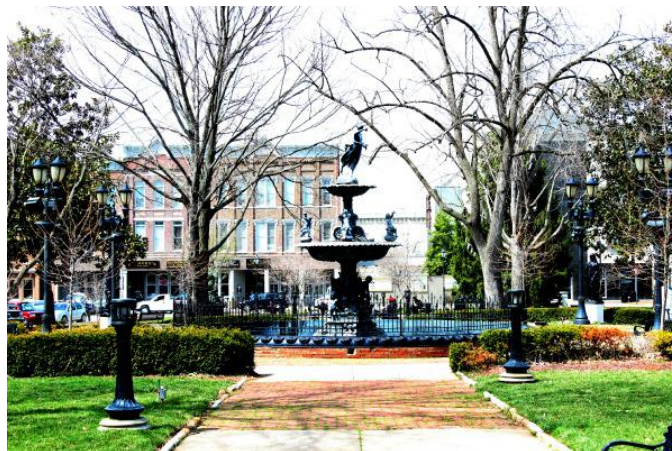
Fountain Square Park